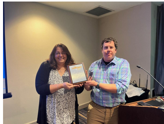
FACES Large Agency Award Recipient Sarasota County