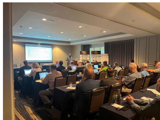
FACERS Fall Meeting Class in Session