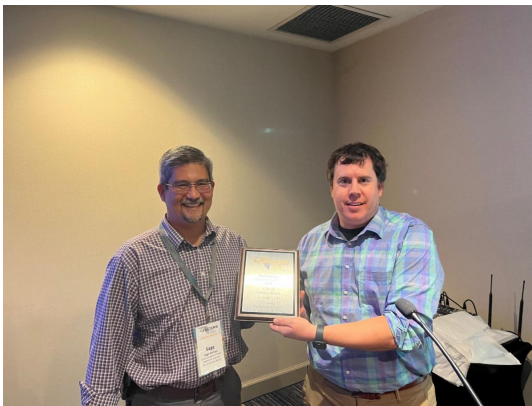
FACERS Small Agency Award Recipient City of Holmes Beach

The FACERS Fall Meeting was held in Hillsborough County at the Grand Hyatt Tampa on November 15-16, 2023. The Agenda covered a wide spectrum of topics from Creative Applications of Model Based Design, LAP 101, Electric Vehicles to Autonomous Vehicles and Transportation Funding and included updates from NACE, FDOT District 1 and 7 Offices, as well as an update from the Central Office in Tallahassee. If you missed the Fall Meeting, you can check out the entire program and the presentations HERE .