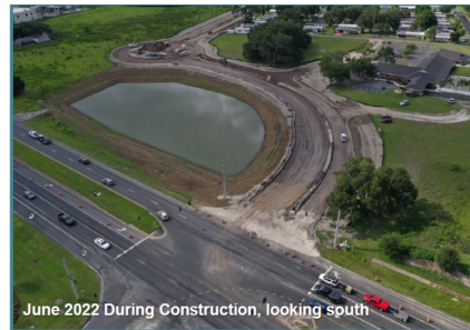
June 2022 During Construction, looking south