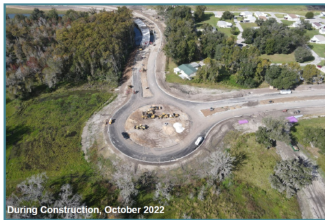
During Construction, October 2022