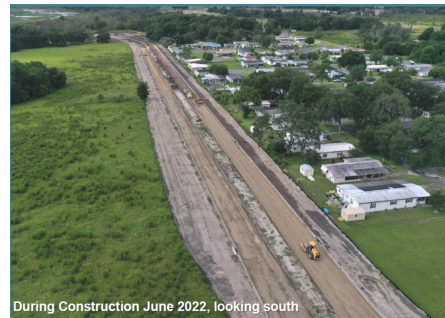
During Construction June 2022, looking south