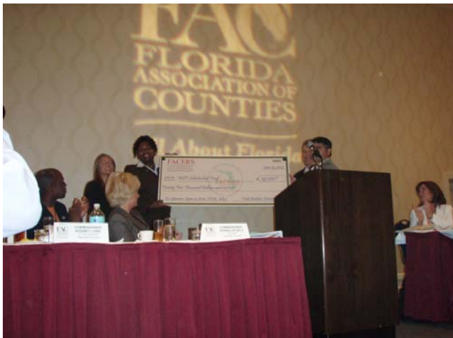
Awarded to the University of South Florida $25,000