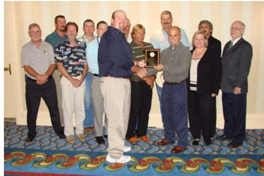
Team Project of the Year Lake County Public Works