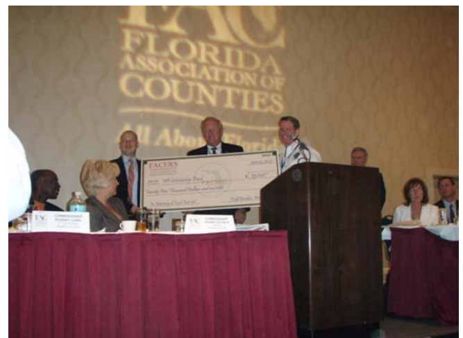
Awarded to the University of Florida $25,000