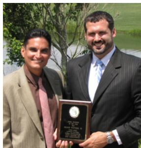
ENGINEER OF THE YEAR