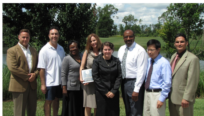
PUBLIC WORKS TEAM OF THE YEAR