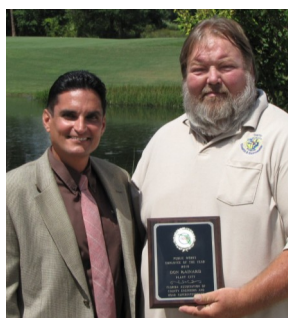
PUBLIC WORKS EMPLOYEE OF THE YEAR