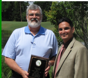
RURAL ENGINEER OF THE YEAR

The 2011 FACERS Awards were presented at the FACERS Annual Meeting in June.