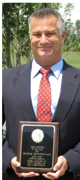
URBAN ENGINEER OF THE YEAR