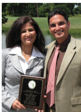
LOCAL / STATE AGENCY COLLABORATION OF THE YEAR