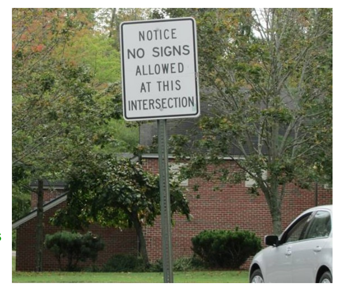
If there are no signs allowed here, what is the strange rectangular shaped white thing with black hieroglyphics????

carolyn.steves@rsandh.com or brian.barnes@charlottefl.com