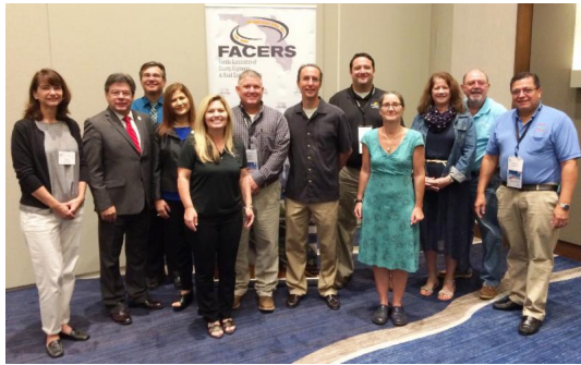
2017-18 Board Installation

We hope that you will join us for the Fall Meeting being held November 15-17, 2017 at the Hyatt Regency Sarasota in Sarasota County. Registration will open in October - we hope to see you there!